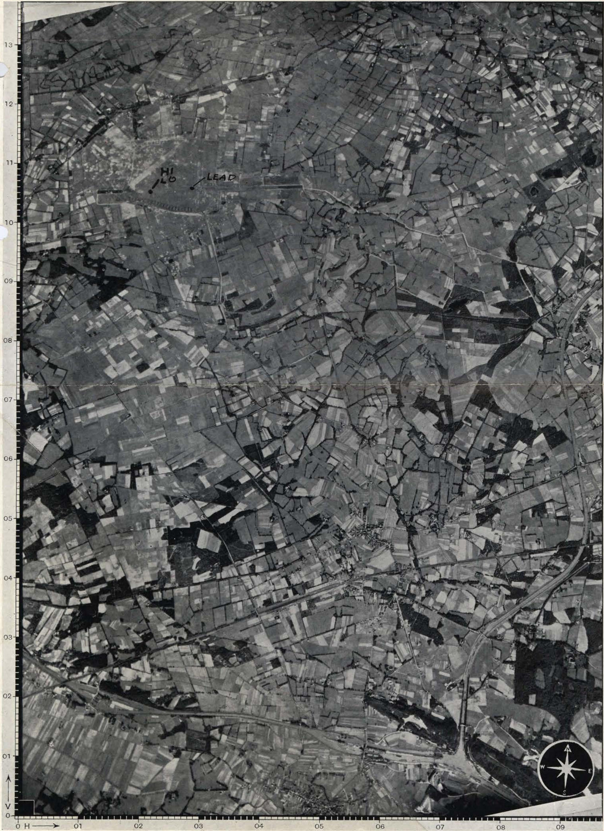
Illustration No. 3/AIR/212/3