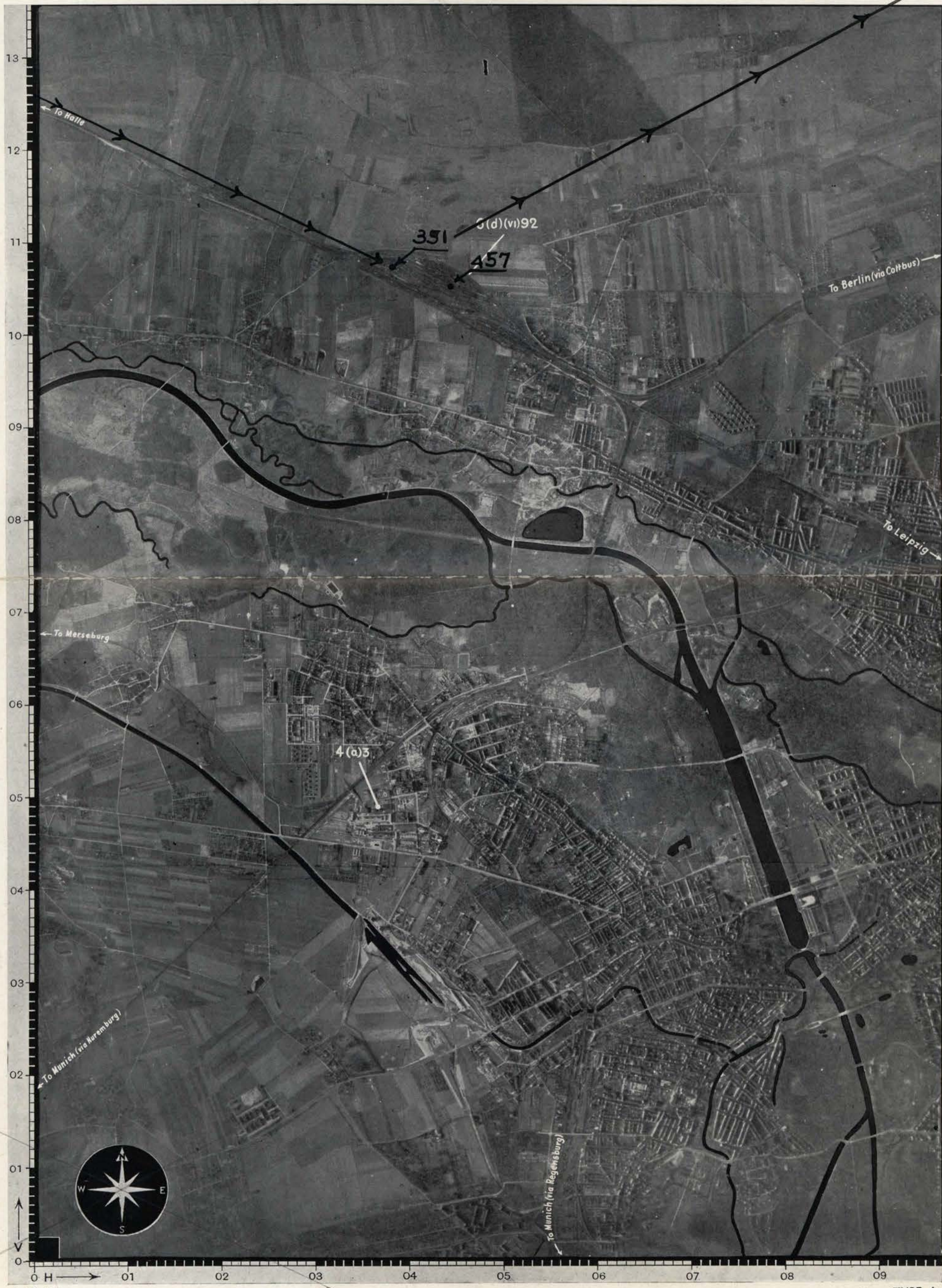
Illustration No. 6 (d) (vi) 92/3 4 (a) 3/4