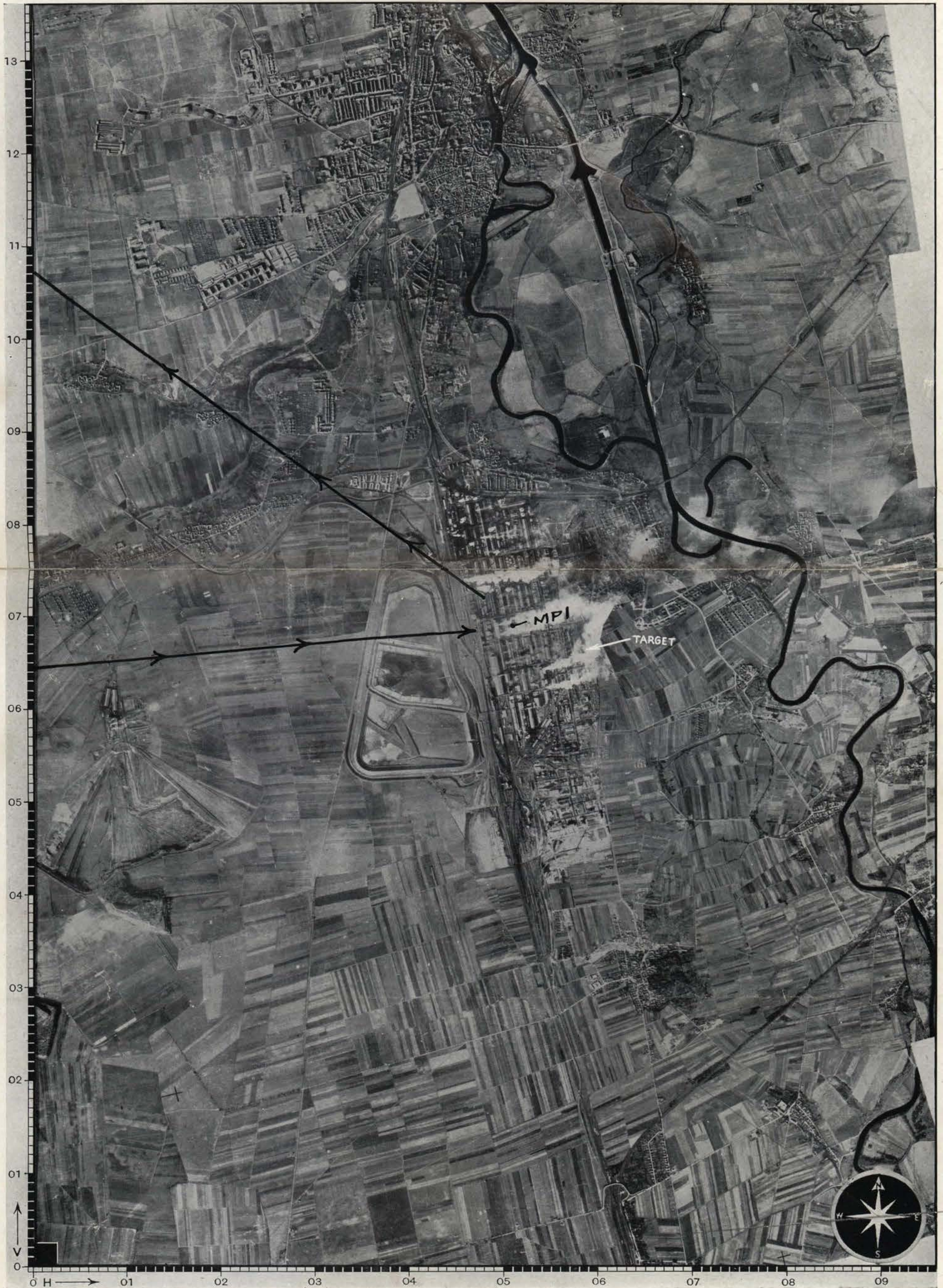
Illustration No. I (a) (iii) 15/13

DECLASSIFIED PER NND745005 BY SP NARA DATE 1/8/11