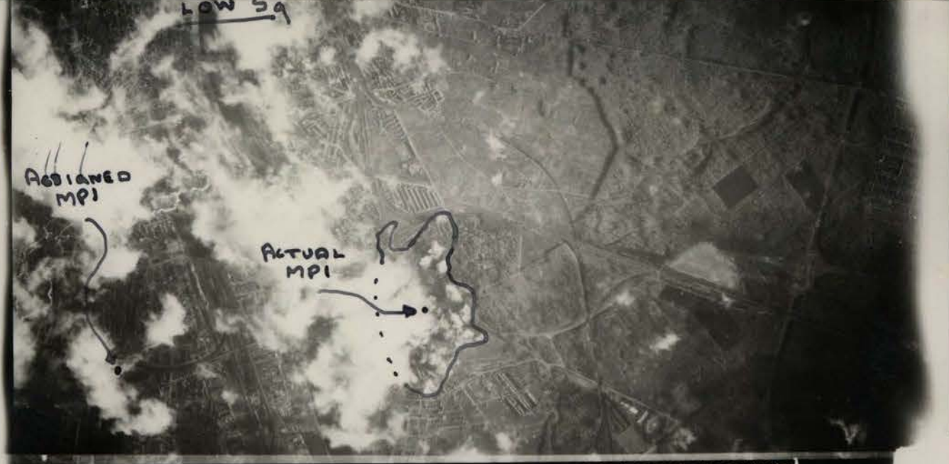
401A/776-14 X5 - 11-44X4 - 8565 7-261 00(FRANKFURT) CONFIDENTIAL