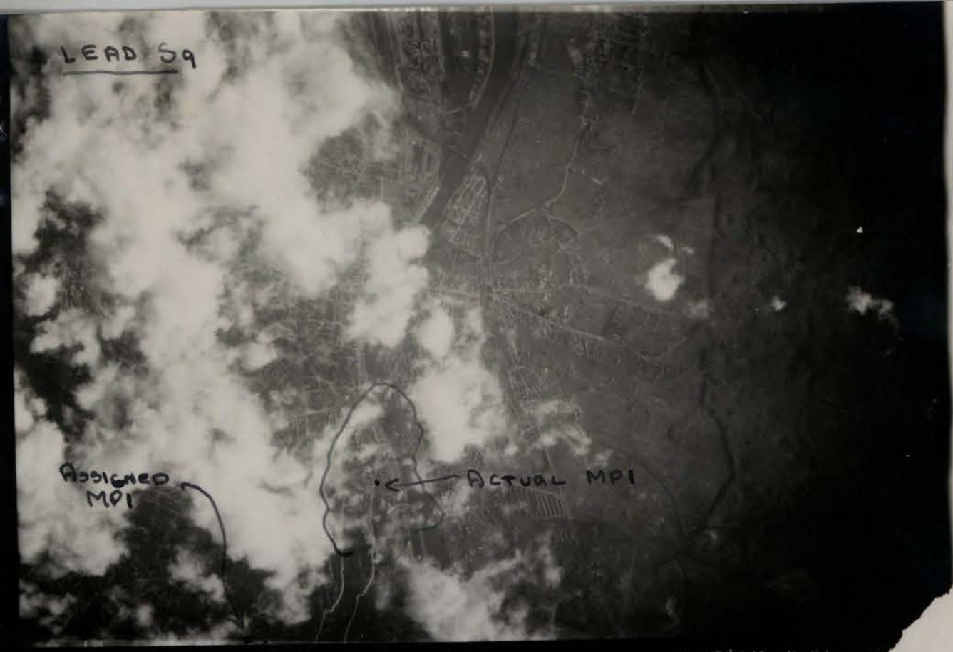
401A/777-10 X3 - 11-44X4 - 8565 7-261 00(FRANKFURT) CONFIDENTIAL