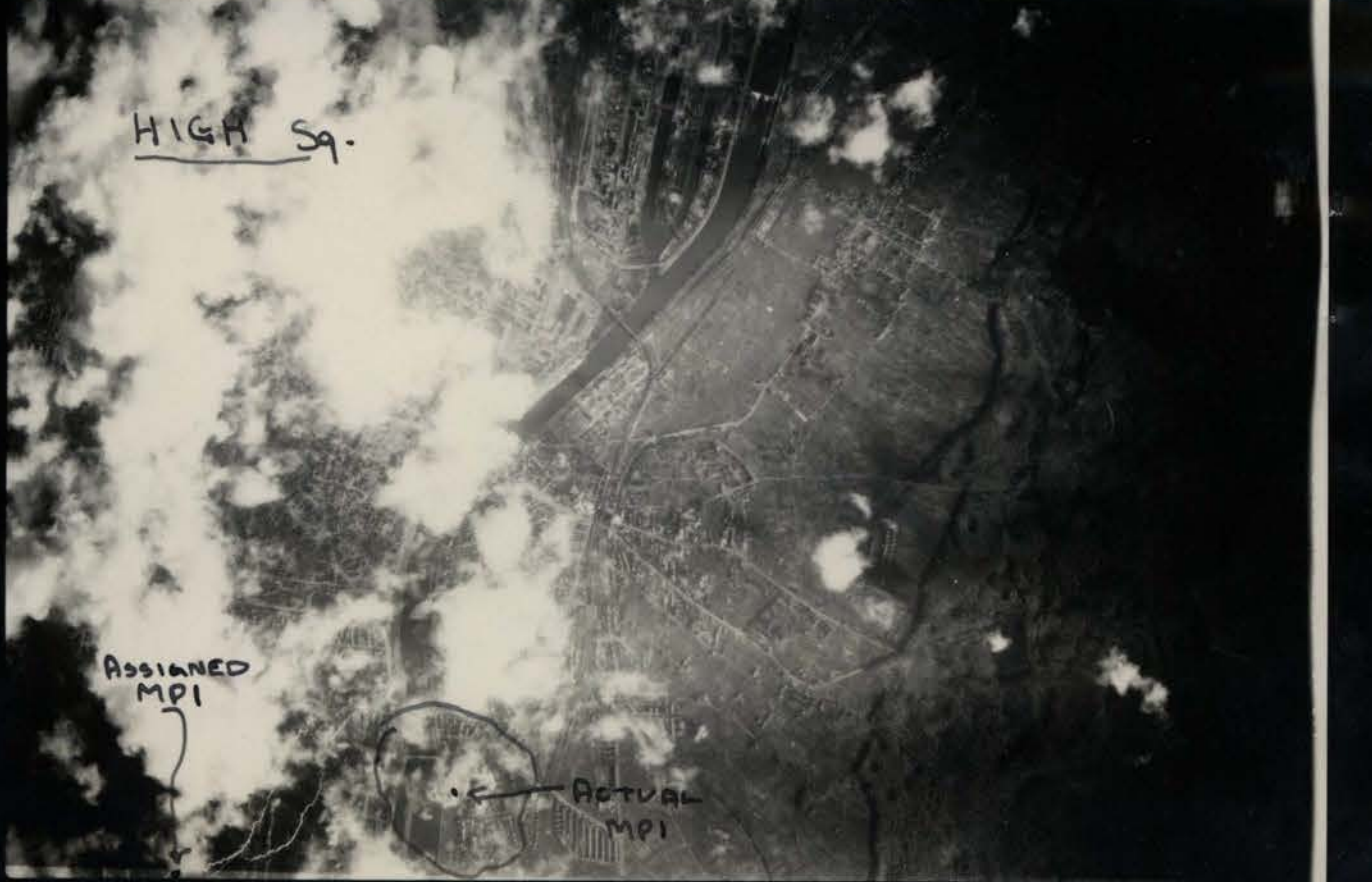
401B/781-11 X5 - 11-44X4 - 7602 7-210 00(FRANKFURT) CONFIDENTIAL