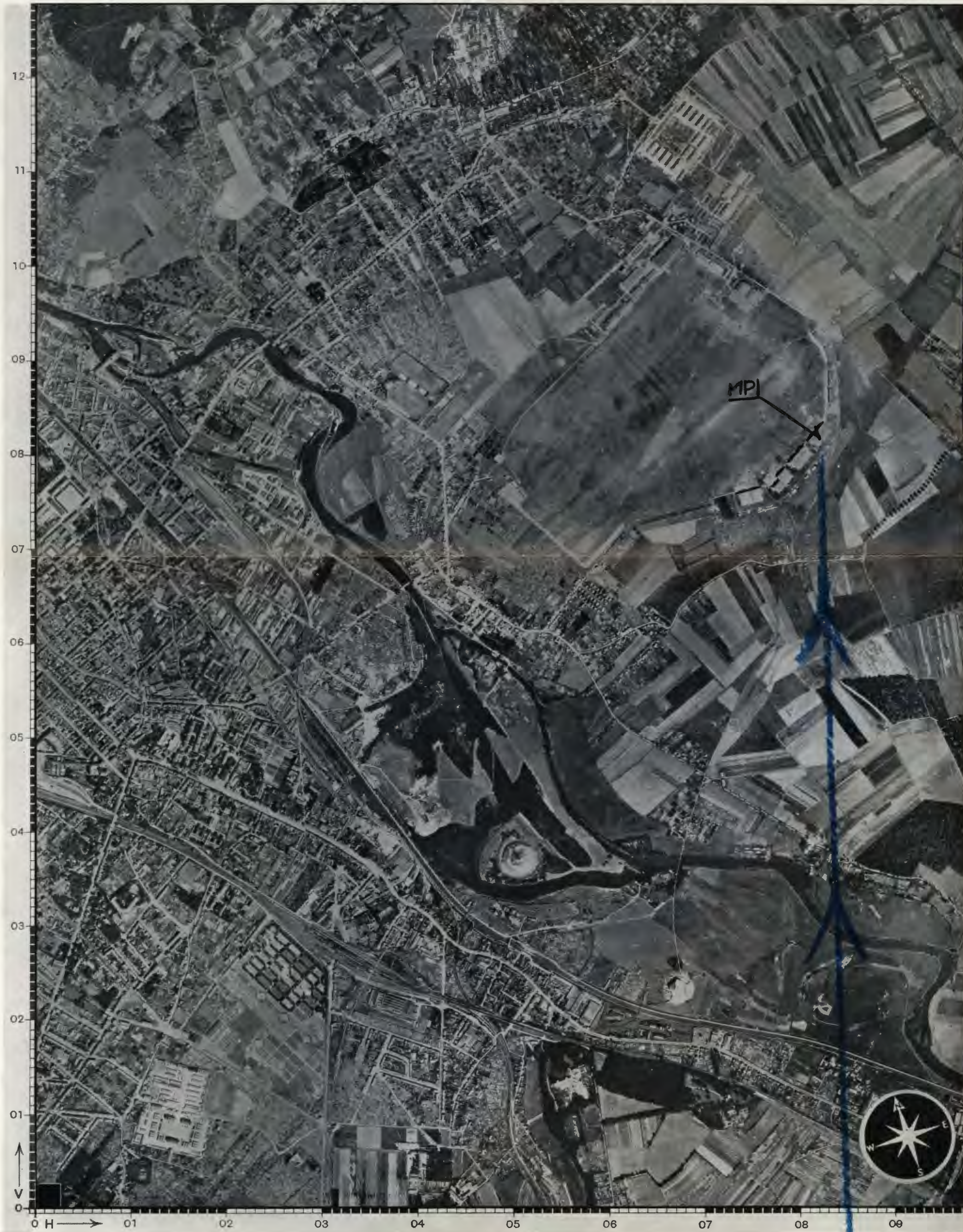
Illustration No. S. 5686/1