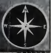
Illustration No. 4 (a) 7/9