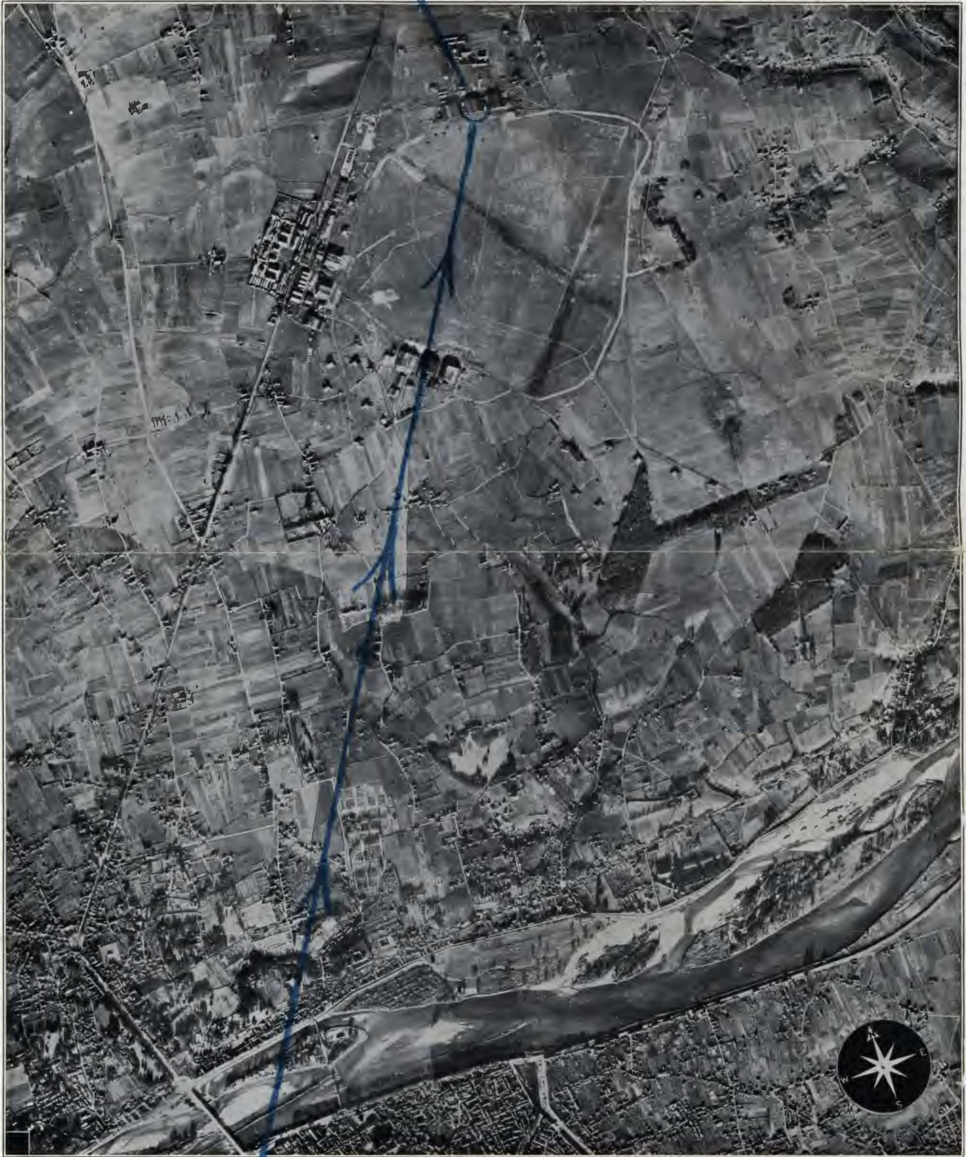
Illustration No. S. 1593/3